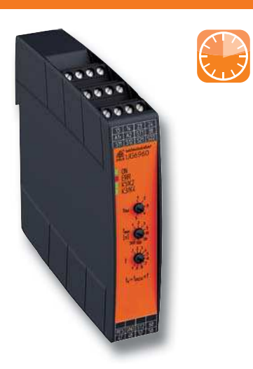
SAFEMASTER C - UG 6960 safe time and safety functions feasible